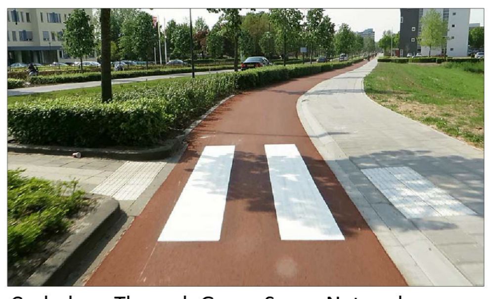
Cycle-lane Through Green Space Network