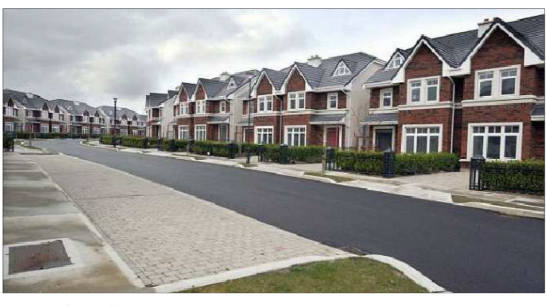
Typical Parking Layout